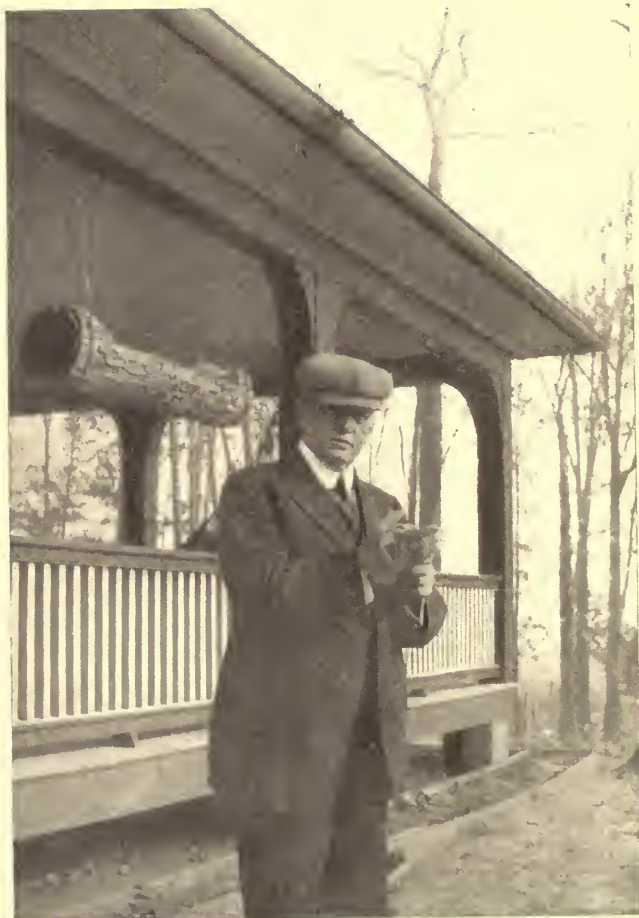
O. Henry in Asheville. A hitherto unpublished snapshot